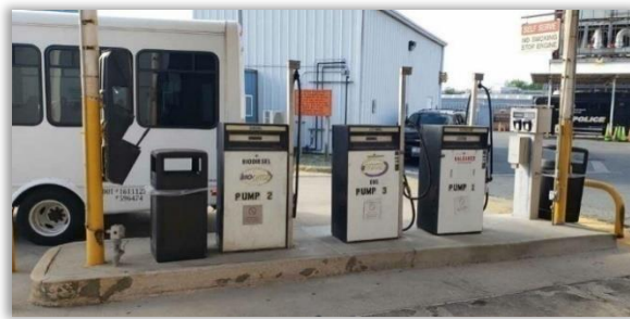
Image of TMB Fueling Stations